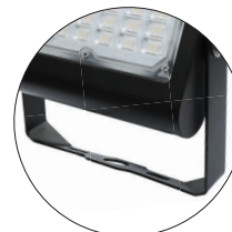
Yolk Mount YM