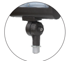
Knuckle Mount KM