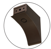
Steel Arm Mount AM