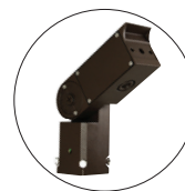
Slip Fitter Mount SF