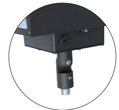
Knuckle Mount KM