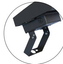
Yolk Mount YM